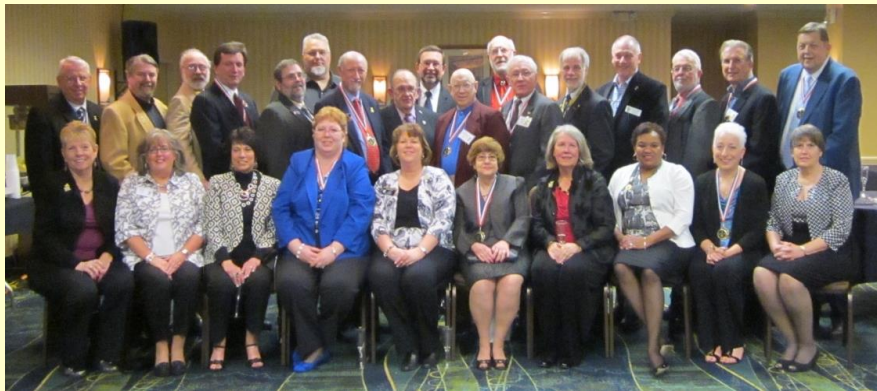
New York JCI Senate Sunday Breakfast after MAI