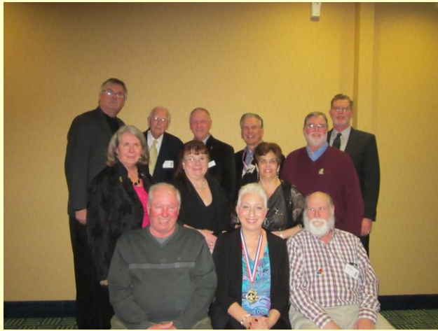
Region 2 and Region 3 Past National Vice Presidents