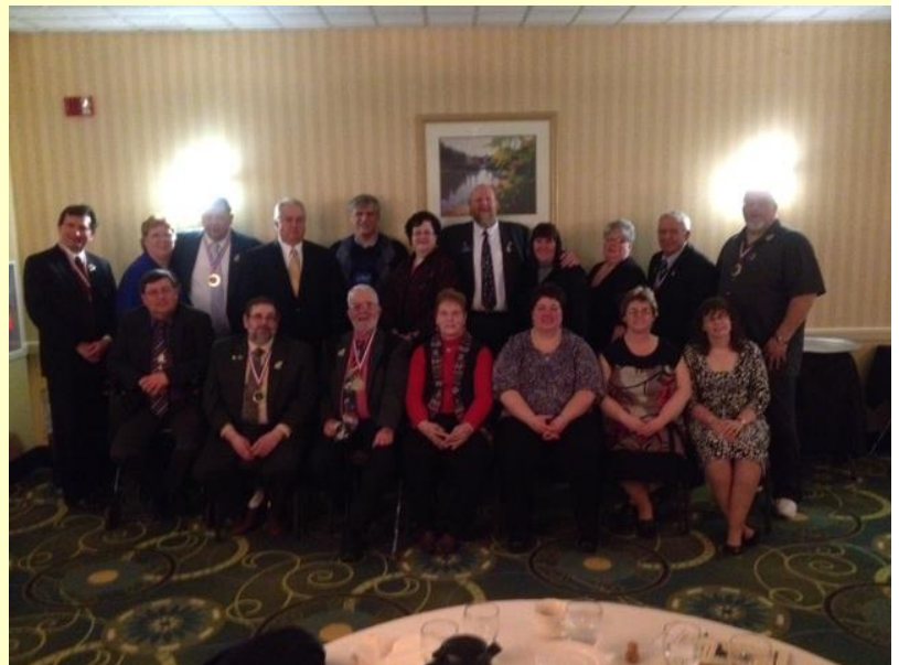
Pennsylvania Delegation to MAI 2014 Grand Island, NY