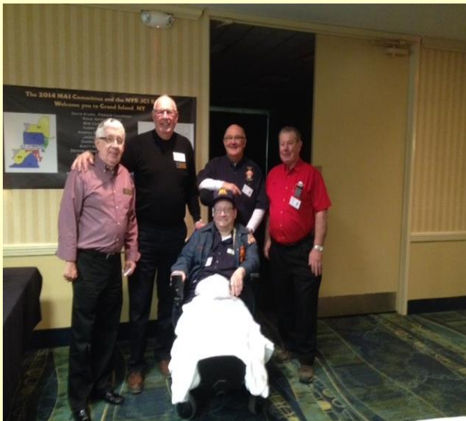
Senator Jim Harmaty visits with the Canadian Senate Delegation in the 2014 MAI hospitality room